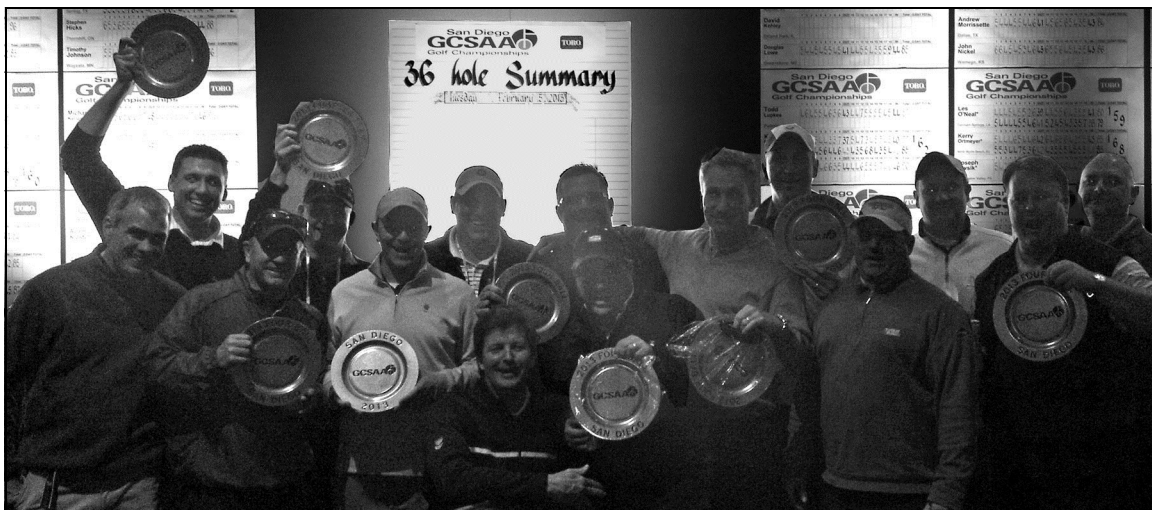
The MAAGCS fielded the most teams and took home the most hardware at the National Championship and Golf Classic in La Jolla.